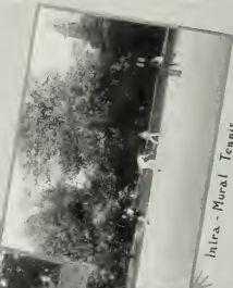
Intra - Mural Tennis